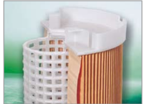
Complete metal-free element