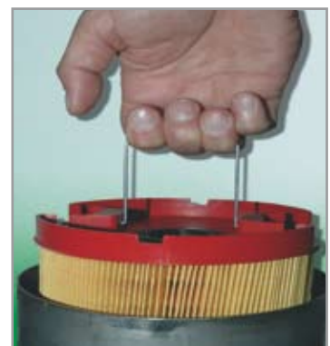
Optional reusable handle